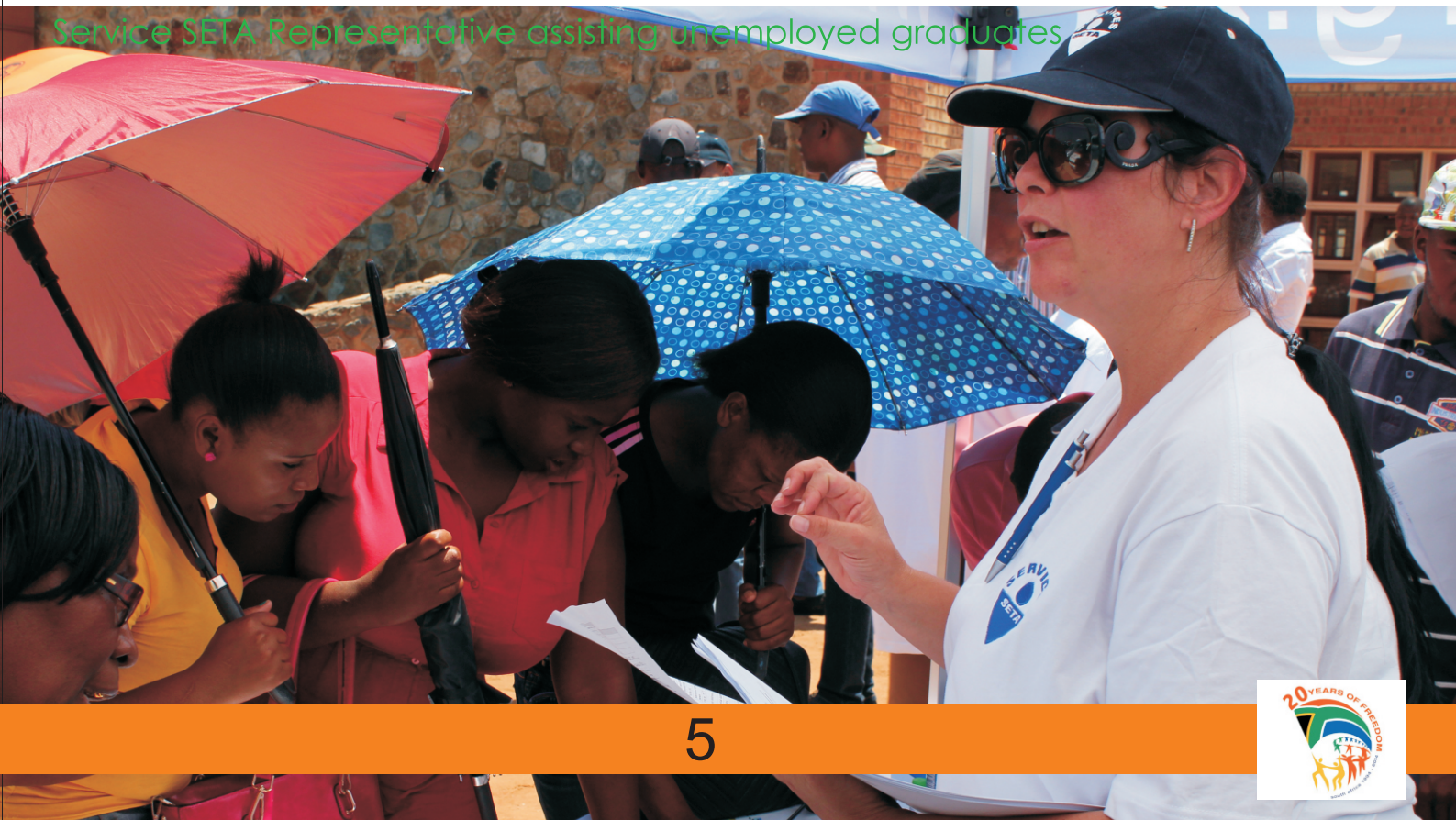
Service SETA Representative assisting unemployed graduates

The Expo lasted for three days from 11th, 12th to 13th of February 2015. The Services SETA has during the event made public announcement that it will fund 190 candidates falling within its scope for Learnerships, Internships and Apprenticeships programme. The fund will benefit 66 candidates for Apprenticeship programme, 28 candidates for Learnership programme and 96 candidates for internship programme that will commence on the 1st of April 2015.