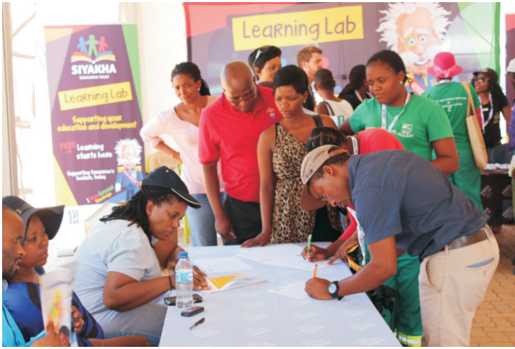
Unemployed graduates visit exhibition stalls to access information

Fetakgomo Youth Development Brigade is a non-profit organization founded by rural young unemployed youth with various tertiary qualifications. They found themselves loitering and idling around the dusty streets of rural communities of Sekhukhune District, Limpopo province.