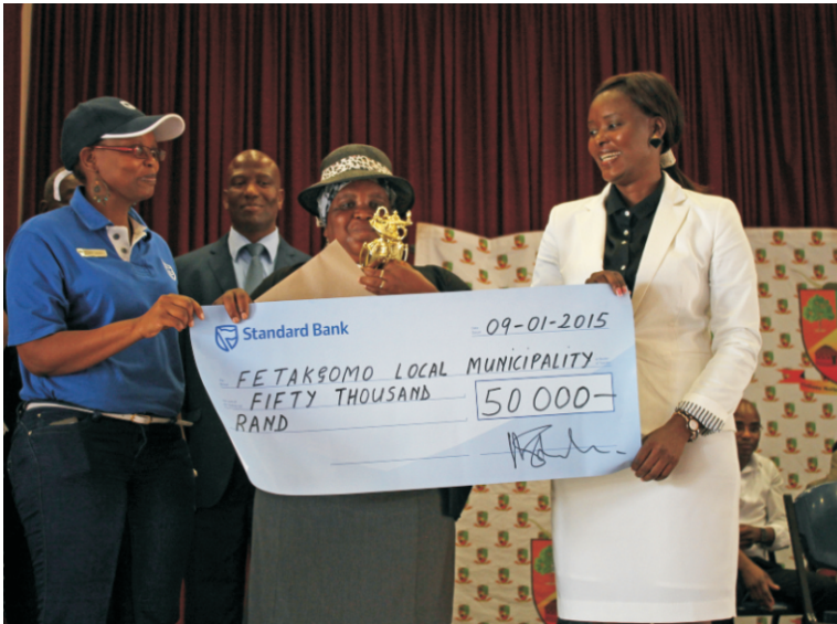
Standard Bank representative together with Fetakgomo Mayor hands over a cheque of R50 000 to top learners

We also welcomed the 2015 National and Provincial Budget that will drive the implementation of the nine-point plan. This budget provides certainty, stability and prudent fiscal management necessary to take the South African economy through these tough economic conditions. In conclusion, welcome the return of the mortal remains of renowned struggle icons JB Marks and Moses Kotane to South Africa from Russia where they were buried 42 years ago